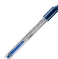
201 T DHS

Digital pH electrode with DHS technology. Temperature sensor integrated. Plastic body for general use. Maintenance free.. pH: 0...14 - T: 0...60 °C cod: 32200103