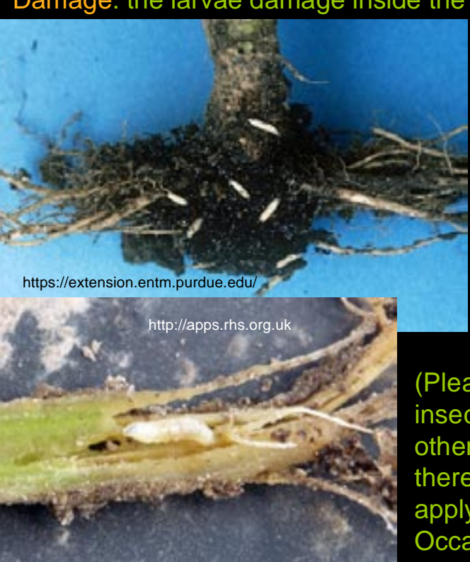
The damage of the larva which should be averted

(Please note that traps specifically optimized for the capture of both of these insects are available; pls refer to our List of Products!) As chance captures, other flies with similar morphology (i.e. Delia platura ) can also occur in case there is a local outbreak in the vicinity of the trap. Therefore we recommend to apply 4 to 5 traps at the same plot for reliable monitoring and detection. Occasionally other insects (hymenopterans, lacewings, etc.) can be found also, these are NOT attracted, just chance captures.